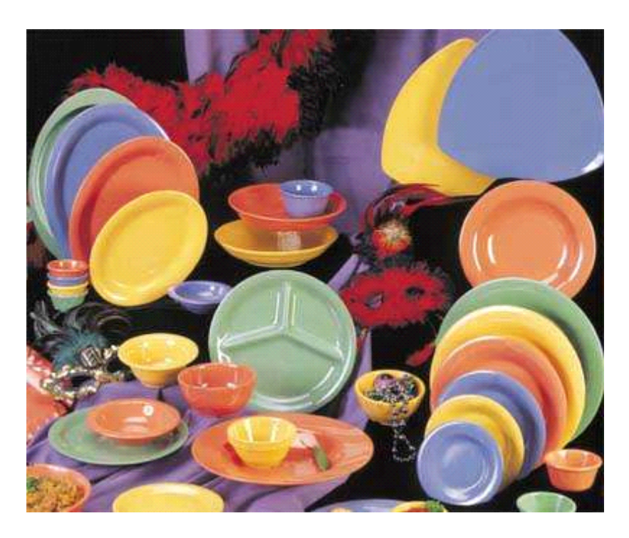
It is also used in home decoration. 'US resistant board'